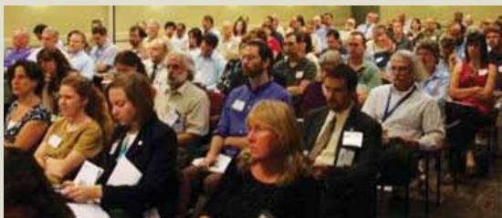
In July 2010, NWF organized New York's first climate adaptation and wildlife workshop in Albany.